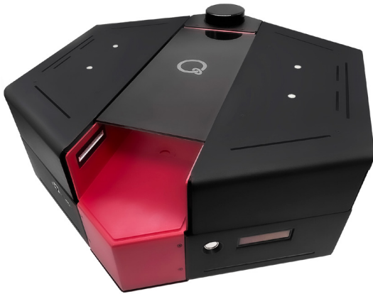
Product may not appear exactly as shown Product shown with QArm Mini (sold separately)