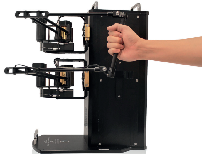
System specifications on reverse page.