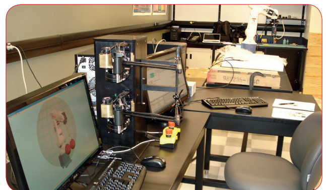
The Health Research Innovation Centre of the University of Calgary is using HD 2 for research and development of the neuroArm, a robotic arm used for telesurgery.